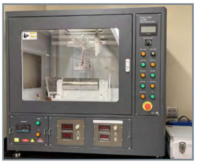
The electrospinner unit used to produce nanofibers.

"I think I am at the peripheral of that, but I hope my background in biopolymers will be useful for water research and similar to the solutions Yan and I proposed in the grant project."